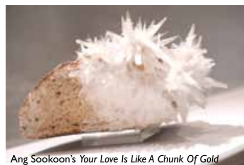
Ang Sookoon's Your Love Is Like A Chunk Of Gold

ascribed to artists connected to seminal '80s and '90s groups like The Artists Village and The 5th Passage is seemingly replaced by presentations that are more subdued — even the ones dealing with certain critical issues. Instant, visceral reactions to art are sometimes eschewed for more contemplative, introspective experiences.