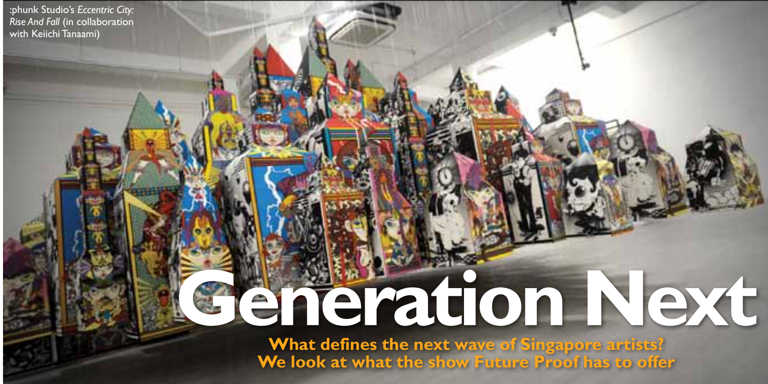
phunk Studio's Eccentric City: Rise And Fall (in collaboration with Keichi Tanaami)