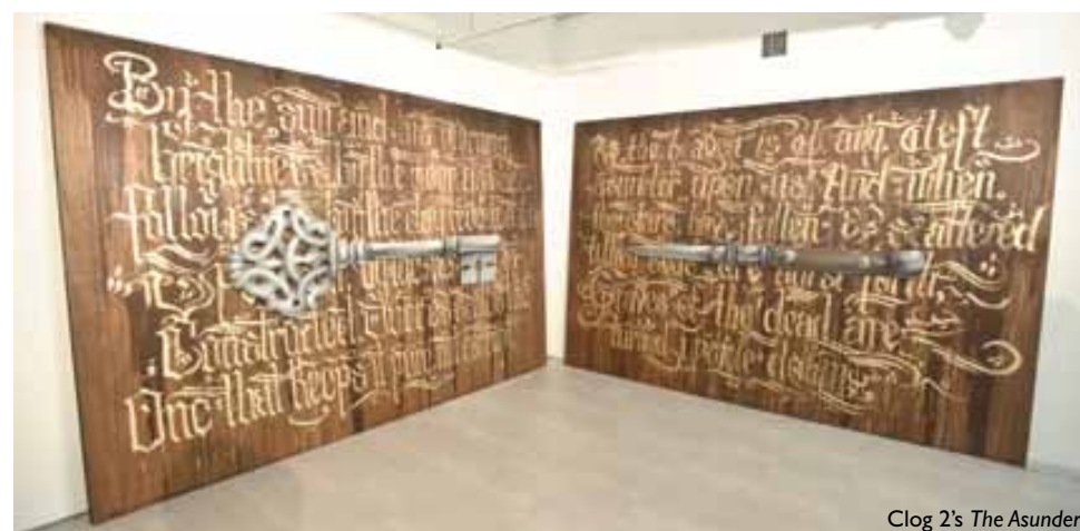
Clog 2's The Asunder