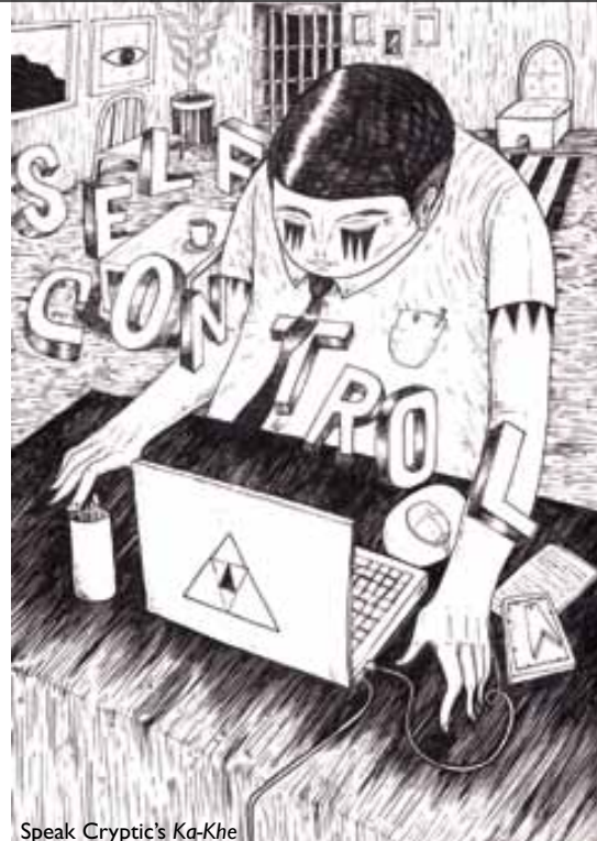
Speak Cryptic's Ka-Khe