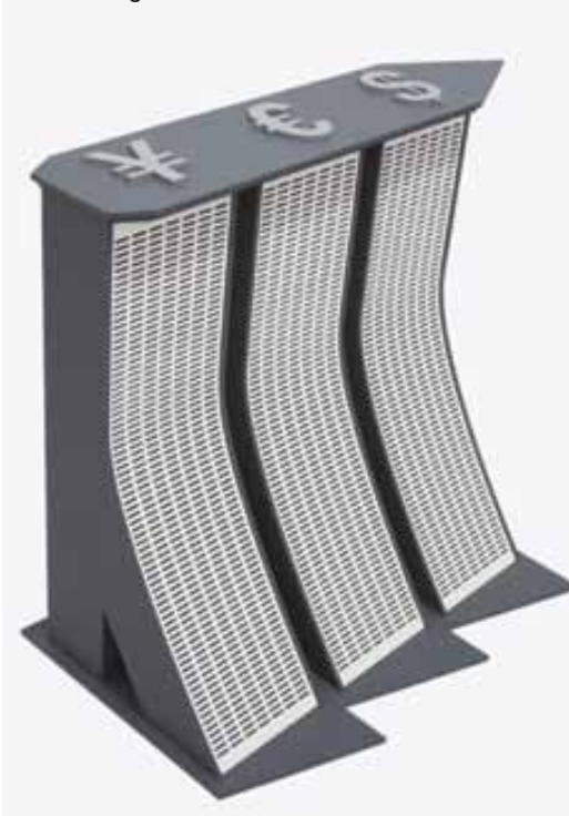
Chun Kaifeng's ¥ € $