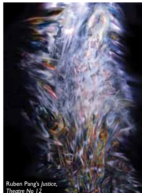
Ruben Pang's Justice, Theatre No 12